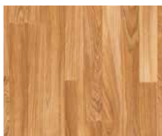
CXF007NE BRUSHBOX (2-STRIP)