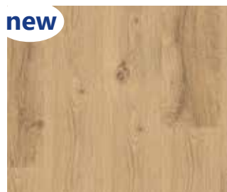
CXF076NE RUSTIC OAK BRUSHED