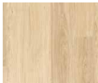
CXF047NE CLASSIC OAK WHITE VARNISHED