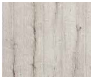
CXF073NE OLD OAK GREY BRUSHED