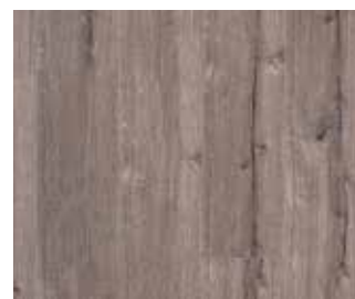
CXF074NE OLD OAK DARK GREY BRUSHED