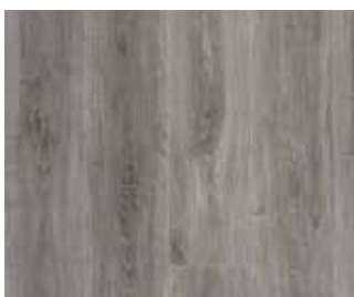
CXF044NE AUTHENTIC OAK LIGHT GREY